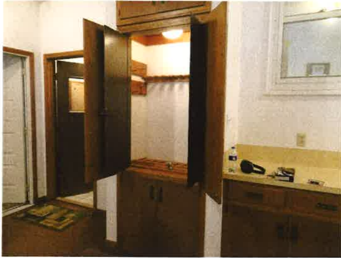
One of two wall safes

Is country living your dream? Come and be enchanted by the whispering winds of the 107-year-old tall pine forest carpeted by violets in the spring. You can plant wildflowers in the tall ditch by the mailbox and watch the colors develop all summer.