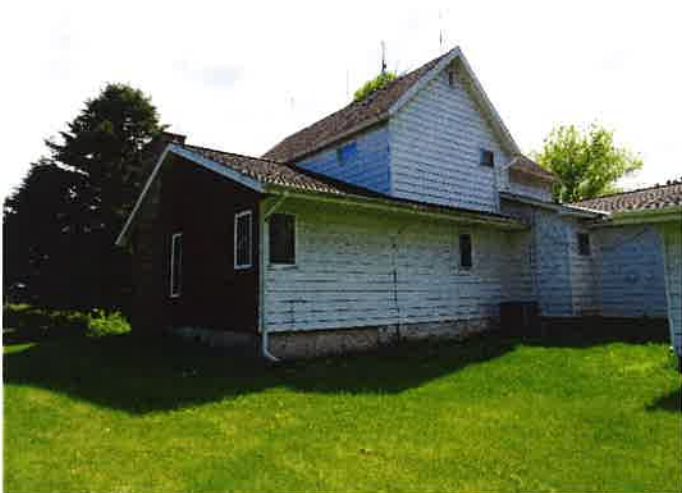
View from the NE