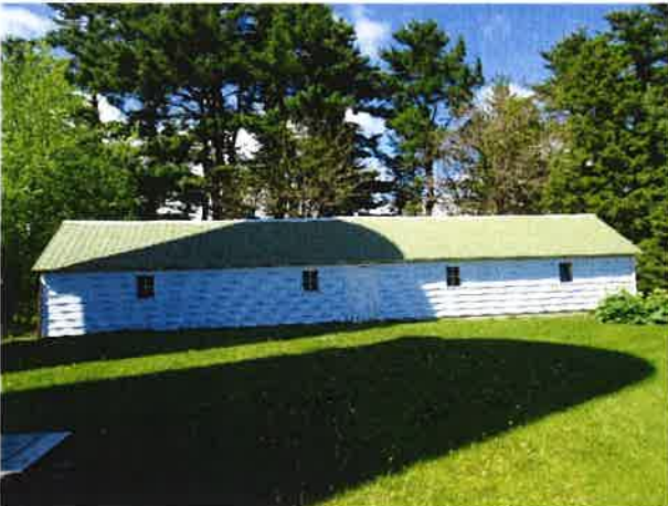
Former Chicken House