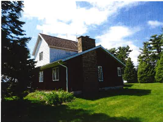
View from the SE