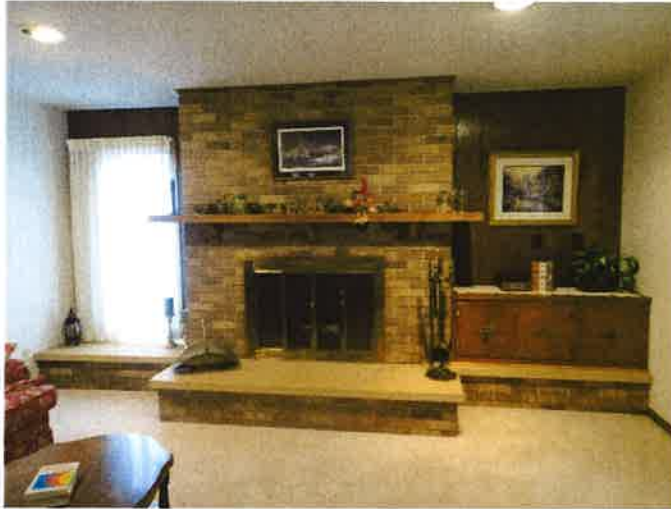
Formal living room