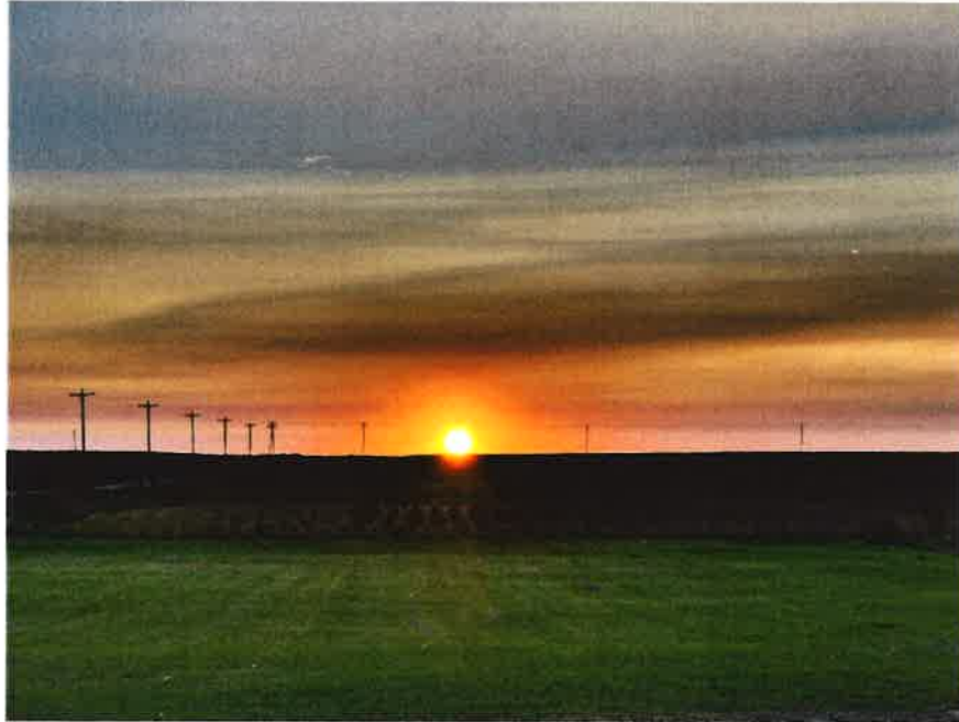
Taken from near the Utility Shed

This information has been gathered from reliable sources but, Benchmark Agribusiness, Inc. does not guarantee the accuracy. All prospective buyers should do their own research and independently verify any information on which they are going to base their decision to buy.