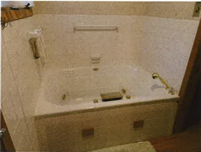
Whirlpool tub + Shower