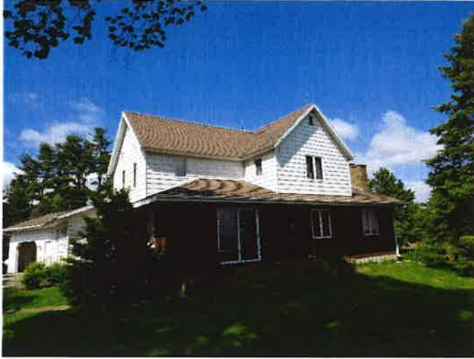
View from the SW