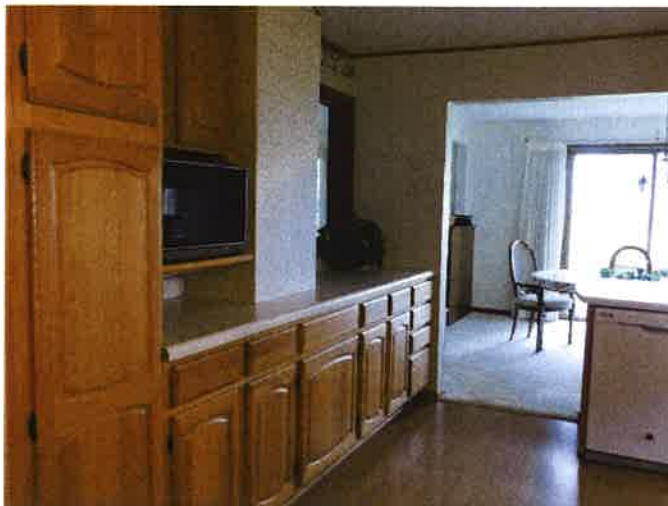
Kitchen & Dining Room