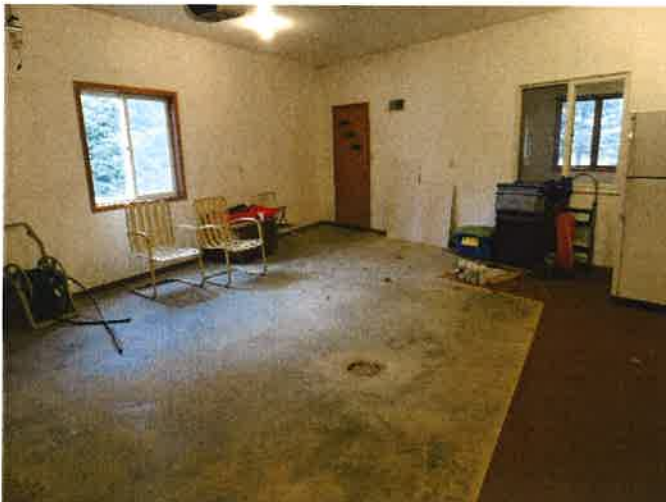
Interior of attached garage